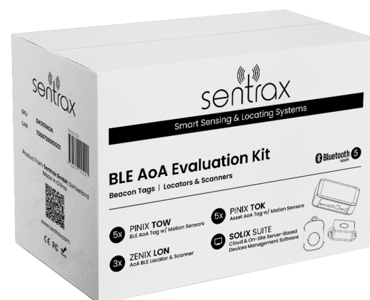
Sentrax's BLE AoA Evaluation Kit

Our Evaluation Kits provide everything needed to get started—Available in BLE AoA and BLE RSSI. Packed with AoA scanners/RSSI scanners, asset and personnel tags, mounting accessories, and access to our middleware and Solix platform.