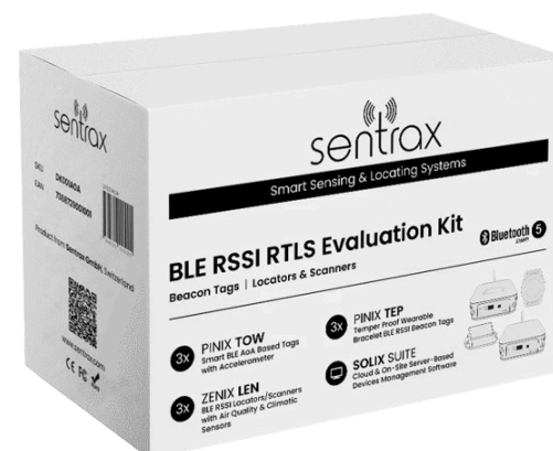
Sentrax's BLE RSSI Evaluation Kit

Designed for quick setup and rapid testing, the kits allow integrators and partners to validate real-time location accuracy, evaluate use cases, and explore seamless integration in their own environment—without the long lead times.