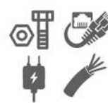
ACCESSORIES Connecting Wire, Batteries, POE Cable, Power Adapter Screws & nuts