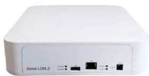
ZENIX LON-2 Quantity: 3