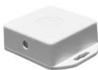
PINIX TOW-1 Quantity: 5